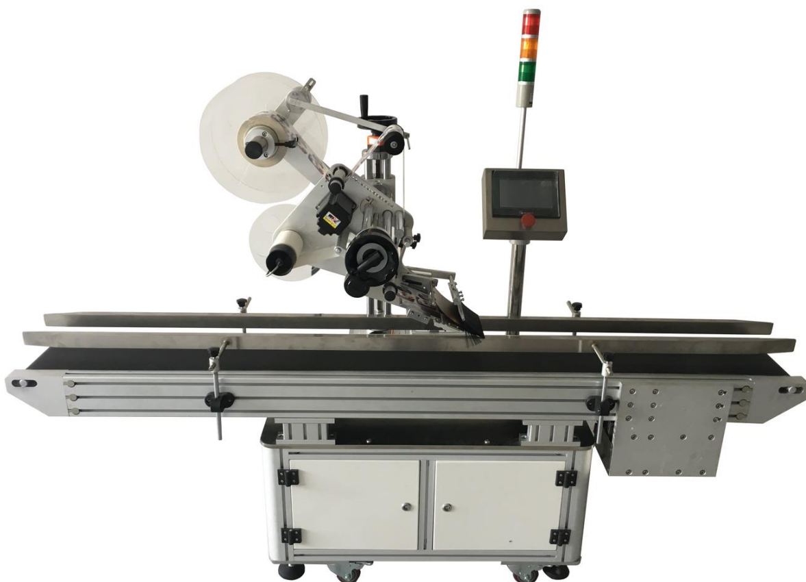
Model : YQ112